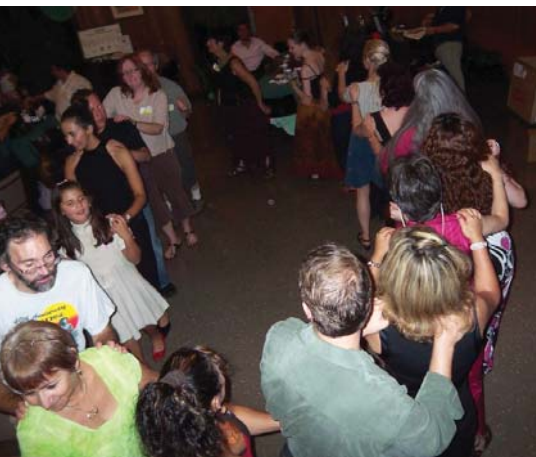
Members form a conga line at May Memorial