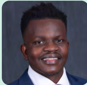
Moise Laub Chair